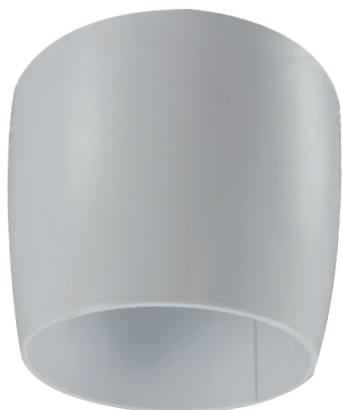
Optional surface mount