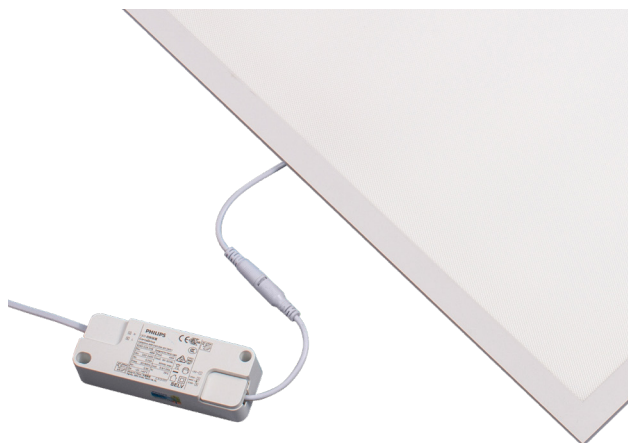
Philips driver with simple twist lock connection